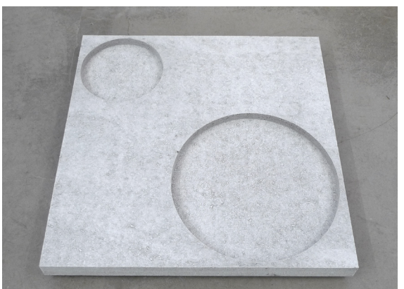
Dots is a sound absorbing wall panel.